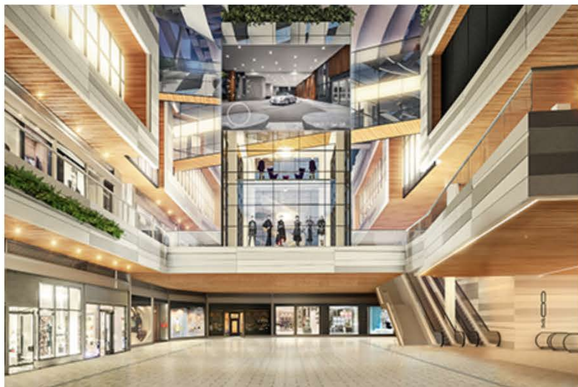
Brickell City Centre

If there's one language all Miamians speak, it's shoptalk. Brickell City Centre, the latest retail destination to open in the 305, boasts not only Brickell's first Saks Fifth Avenue in 30 years but also its first-ever food hall: a three-story, 38,000-square-foot mecca devoted to Italian delicacies. Miamians are giddy over the new U.S. outposts of Acqua di Parma and Italian menswear line Boglioli—just two of the international brands among the center's 85 tenants.